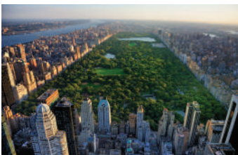
Central Park in New York City

ELS/ New York – Manhattan is adjacent to Battery Park in lower Manhattan, with views of the Statue of Liberty and the Hudson River, and immediate access to the subway, NYC buses, as well as the ferry to New Jersey. Visit famous landmarks like the Empire State Building, Broadway, Times Square, Fifth Avenue, Rockefeller Center, Central Park, Wall Street, and so much more!