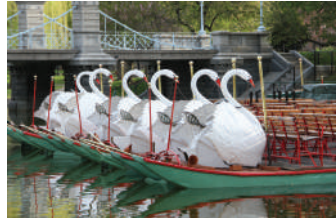
Swan Boats in Boston Public Garden

ELS/Boston – Downtown is in a fun, urban setting in the heart of historic Boston, and close to outdoor parks, ball fields like Fenway Park, and the Boston Public Library. You can visit many nearby colleges and universities, go to a rock concert, enjoy live theater, or cheer at a professional sports game. Those interested in history can walk along Boston's famous Freedom Trail – which starts directly outside the Center!