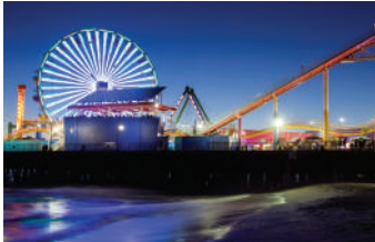
Santa Monica Pier

ELS/Santa Monica in downtown Santa Monica – on the famous Third Street Promenade – is home to colorful and lively sidewalk singers, artists, theaters, shops, and open-air restaurants just two blocks from the Pacific Ocean. Enjoy the Santa Monica Pier, numerous art and cultural events, or travel to famous locations like Venice Beach and Beverly Hills.