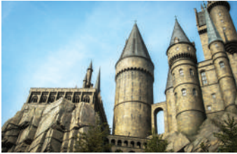
The Wizarding World of Harry Potter™ at Universal Orlando™

ELS/Orlando, in the Stetson University Center Building, is in the charming town of Celebration, Florida. Celebration offers parks and lakes, a golf course, and walking and cycling trails where you can experience Floridian landscapes and wildlife. Both the Gulf of Mexico and Atlantic Ocean beaches are about an hour's drive away, and thrilling iconic theme parks are also nearby – including Walt Disney World®, and Universal Orlando Resort™.